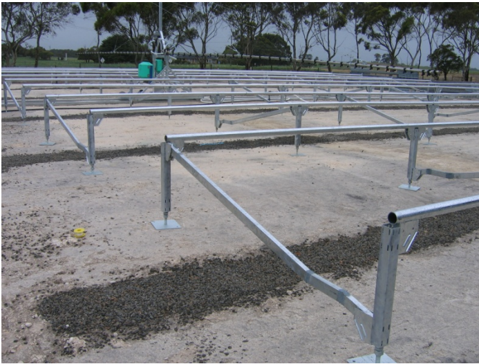
Fast installation – no concrete footings required