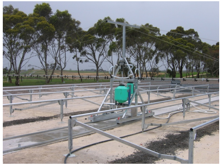
Easy to incorporate our outdoor travelling irrigators