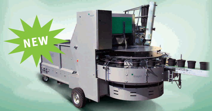
Potting machine TM 2400