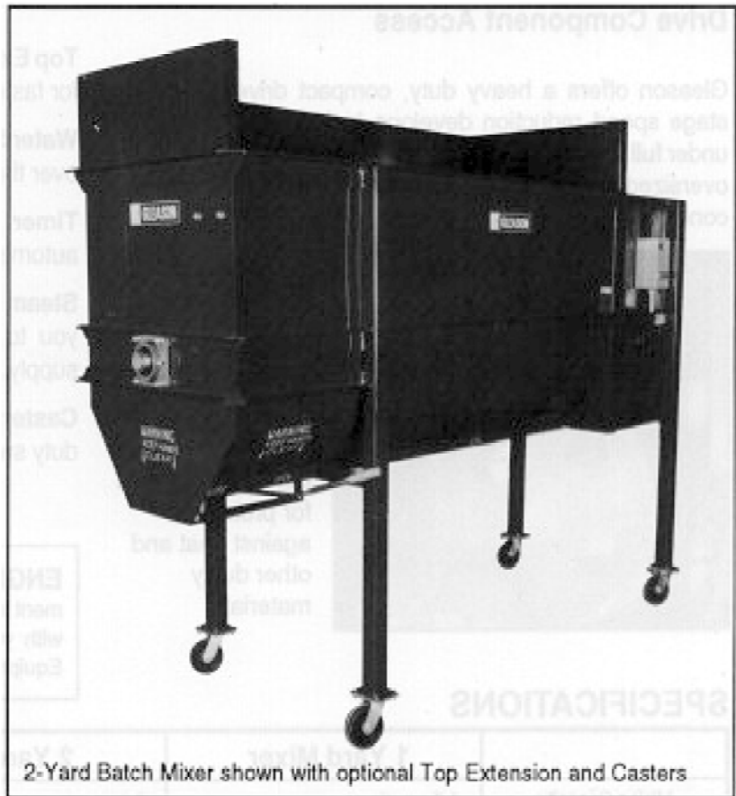
2-Yard Batch Mixer shown with optional Top Extension and Casters